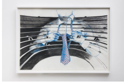
Study for Tension Building