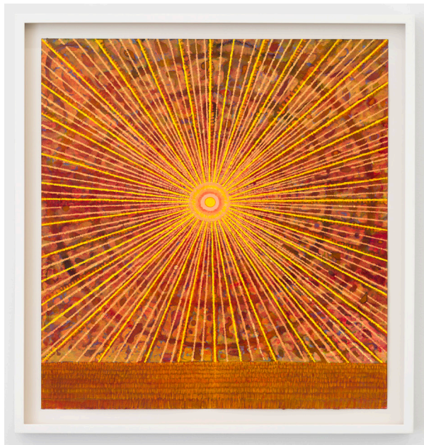
Sky Glabush Burning (Study) , 2023 Watercolor and gouache on paper, framed with Optium Museum Plexiglas 21 x 18 in 53.3 x 45.7 cm

Philip Martin Gallery is proud to present, “Spaces,” an online exhibition of works by Sky Glabush, Kristy Luck and John Joseph Mitchell. In their respective practices, these three artists consider landscape as a convention of picture-making and a means by which to explore interiority and expression.