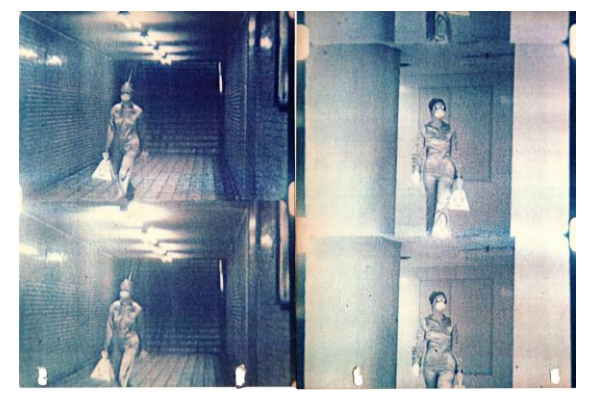
Fig. 2. Film still from Carl Cheng, Emergency Nature Supply Kit (E.N. Supply, No. 271-OJ) , 1971. 16mm film transferred to digital (digital transfer 2015), 7:47 min.

Cheng's title is as officious as it is quixotic. The alphanumeric identification points to the object's seriality—it is one among others—as well as to