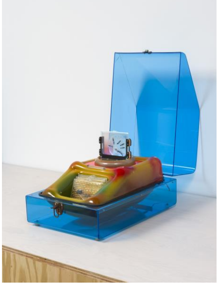
Figs. 5, 6. Left: Carl Cheng, Specimen Viewer No. 1 , 1970. Plexiglas, vacuum-formed acrylic plastic, plastic cases, 4 specimen cases, LED lights, wiring, metal latch and hinges, 11 x 12 x 19 in.; right: Carl Cheng, Specimen Viewer No. 1 , 1970. Plexiglas, vacuum-formed acrylic plastic, plastic cases, 4 specimen cases, LED lights, wiring, metal latch and hinges, 11 x 12 x 19 in.