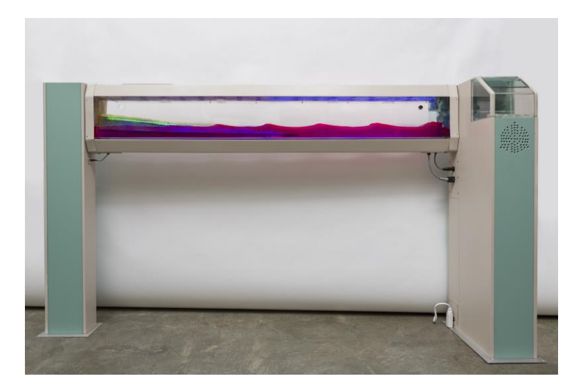
Fig. 15. Carl Cheng, First Generation Family Entertainment Center, 1968. Painted wood, acrylic water tank, water, electrical hardware, sound player, 52 \times 94 \times 1/4 \times 16 \times 1/2 inches.

Such positions might be described as techno-skeptical rather than techno-utopian. Cheng, far from alone in this perspective, uniquely embedded this critique into his work. His artworks are often hilariously impotent machines or tantalizingly deceitful gadgets; they plait invocations of lurking threats and invitations to look as a gratifying mode of leisure. Taken together, Cheng's oeuvre from this period mobilizes Minimalist forms and materials as well as conceptual plays with authorship and distribution; post-Minimalist engagement with systems and material change; and Institutional Critique's concerns about the conditions of exhibition and display. It would be easy to make a case for their importance on the basis of familiarity—as annotations on canonic art histories of the period—or to suggest that they are easily accommodated into existing narratives: riffs on a familiar variation. I would like to consider them outside a framework of assimilation, not for their similarities to dominant artistic movements, but for their differences.