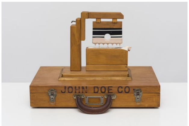
Fig. 10, 11. Carl Cheng, Art Tool Paint Experiments, Paint Dipper Display Box, 1972. Wood, paint, 8 x 18 x 12 in. Courtesy of the artist and Philip Martin Gallery, Los Angeles

Absent the sleek materials characteristic of Minimalist sculpture, the Art Tool Experiments jab at that post-Minimalist shibboleth, "process."<sup>31</sup> They are perhaps most concisely described as knowing gimmicks. The gimmick, as theorized by Ngai, is a specifically capitalist phenomenon. Its primary function is that of abbreviation: it saves time, reduces labor, and cheapens value. To name something a gimmick is to express an ambivalent aesthetic judgment (it is both "wonder" and "trick"), in which the object's capacity to enchant is immediately superseded by feelings of distrust, aversion, or a sense of fraudulence.<sup>32</sup> Affective elation is followed by its consequent puncture; aesthetic pleasure deflates. The gimmick yokes a determination of negative aesthetic worth to one of low or negative economic worth; that is, its cheapness. Similar operations suffuse Erosion Machine