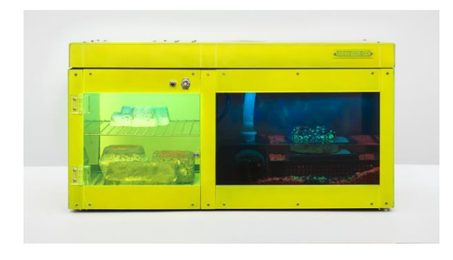
Fig. 12. Carl Cheng, Erosion Machine No. 4 , 1969. Plexiglas, metal racks and fittings, plastic, water pump, LED lights, black light, pebbles, 4 erosion rocks, wood base, 15 x 25 x 9 in.

No. 4, an acid-yellow appliance that pummels various stones with water until, like the results of a sculptor's subtractive chiseling, they transform into new shapes (1969; fig. 12).<sup>33</sup> In the erosion compartment on the right, an individual rock receives its violent bath. Other rocks sit patiently on metal racks in the left compartment, like scones cooling after a bake. Like Cheng's Art Tools and Specimen Viewers, the Erosion Machines are "overrated" devices, easily judged to be both "working too little (labor saving tricks) but also as working too hard (strained efforts to get our attention)."<sup>34</sup> In its unease about labor, time, and value, the gimmick, Ngai suggests, raises those very