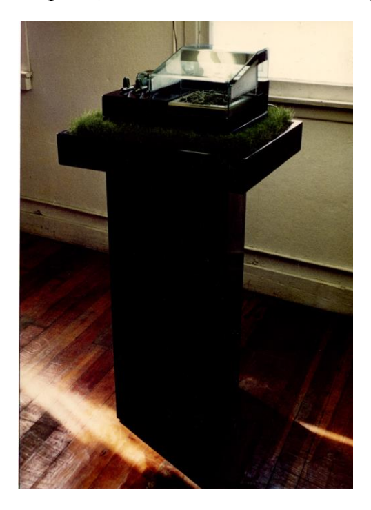
Fig. 19. Archival photograph of Carl Cheng, Supply & Demand, 1972. Venus flytraps, insects, plastic case, humidifier, wiring, grass, wood pedestal, grow lamps, 47 x 24 x 18 5/8 in. Courtesy of the artist and Philip Martin Gallery, Los Angeles

also 1972).<sup>48</sup> When I first encountered this work, I read in it a tidy model of what Marxist theorists call secular crisis: capital requires not only expanded reproduction, but also accumulation, and secular crisis describes "the long-term tendency of capital to exhaust and expel the very resources it requires to endure."<sup>49</sup> The system cannot sustain itself indefinitely, I thought, at some point, more flies would need to be procured.