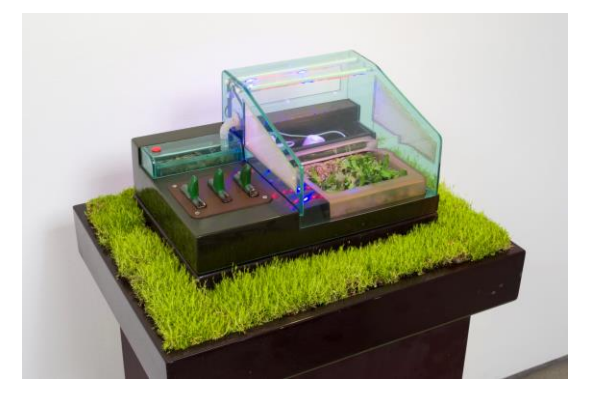
Fig. 18. Carl Cheng, Supply & Demand , 1972. Venus flytraps, insects, plastic case, humidifier, wiring, grass, wood pedestal, grow lamps, 47 x 24 x 18 5/8 in. Courtesy of the artist and Philip Martin Gallery, Los Angeles

Machines erode and natural resources are finite. So too is labor-power continuously withdrawn from the market by wear and tear, physical deterioration, and, ultimately, premature death.<sup>46</sup> Labor-power requires replacement, Marx tells us; "since more is expended, more must be received."<sup>47</sup> Cheng's Supply & Demand stages these grisly realities (1972; fig. 18). It houses, in one chamber, a number of flies, only to transport them pitilessly into the maw of a Venus flytrap awaiting its meal in the next. With its lights and knobs, this seemingly complex device is, in the end, little more than a feeding chute, a grim joke (procedurally related but tonally divergent from Hans Haacke's Rhinewater Purification Plant ,