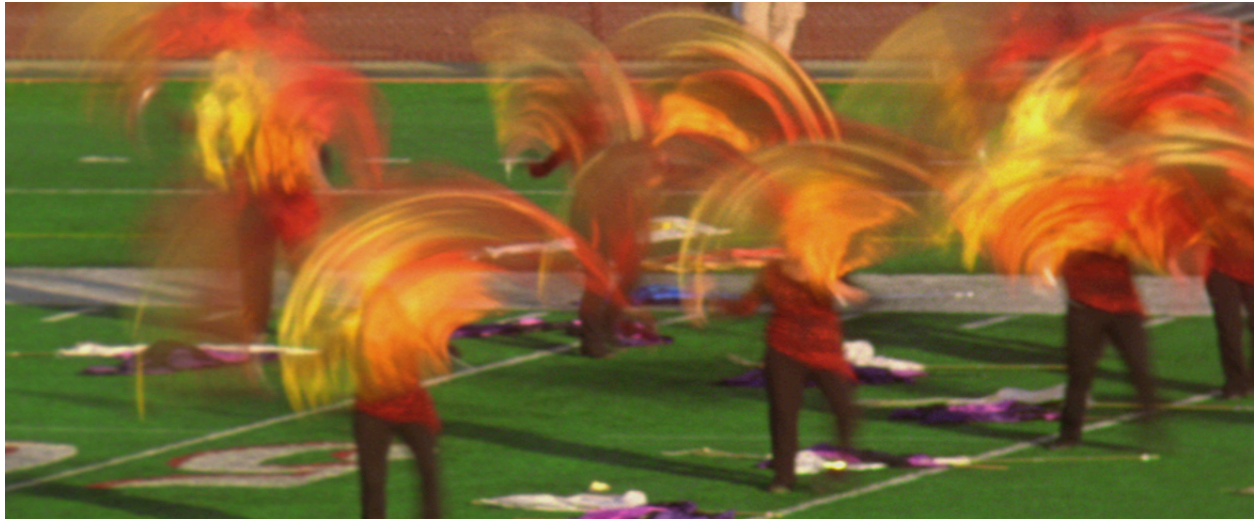
A still from Ericka Beckman's "Tension Building," 2016.

In Ericka Beckman's video "Tension Building," we hear the rat-a-tat-tat of a marching drum as the camera pans briskly around stadium seats. Every so often, the camera hits an obstacle, and each time it does, we hear video-game sound effects — bells, boings, cartoon thuds. As the camera's pace quickens, we find ourselves thrust into game day action — football players do jumping jacks, cheerleaders pump their pom-poms, a marching band plays, spectators clap.