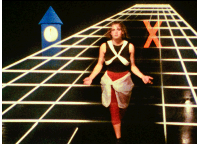
A still from Ericka Beckman's "Cinderella," 1986.

In "You the Better," a film that caused a ruckus when it first debuted at the New York Film Festival in 1983, Beckman examines games of chance and gambling. Artist Ashley Bickerton performs the mechanics of the game servicing an off-camera betting entity known as the "House." Yes, the game keeps changing and players are swapped out, but one thing remains the same: "the 'House' is hidden and controls the bets, the 'chance' of winning is nil. The game, in fact, is not between the players, but rather between the 'House', and the 'Bettor.'"