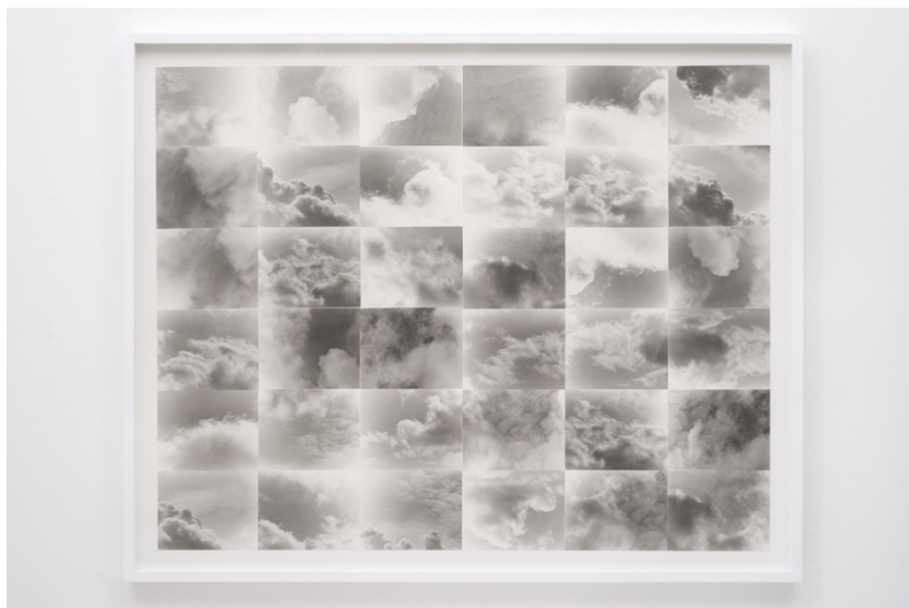
Lew Thomas, CLOUDS , 1973 / 2015 36 gelatin silver prints, mounted and framed 52 × 64 inches ■ Available Inquire

2712 S. La Cienega Blvd., Los Angeles, CA 90034 philipmartingallery.com (310) 559-0100